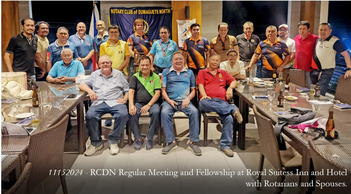
11152024 - RCDN Regular Meeting and Fellowship at Royal Suites Inn and Hotel with Rotarians and Spouses.